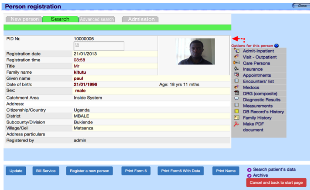
Fig. III.3: Paper like look and feel for patient registration with links to standard forms such as Form 5